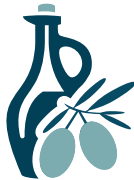
Healthy Fats & Oils